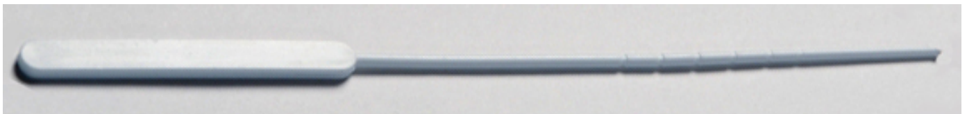
Rocket R57420 Uterine Sound – old style

We have taken this opportunity to re-design and improve upon the original design while retaining its best and familiar features.