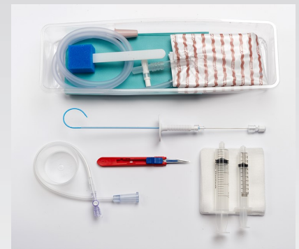
R58800-06-BK Rocket BLUE™ Drain Ward Procedure Pack

For the drainage of abdominal ascites using a 'direct stab' technique combined with aspiration and/or ultrasound guidance.