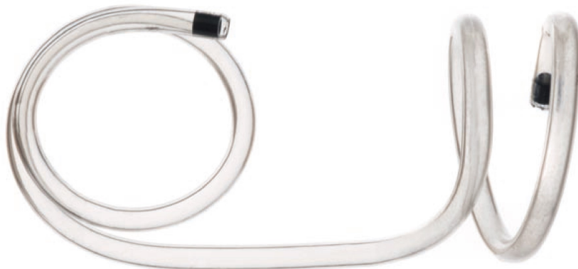
R57405 Rocket KCH™ Fetal Bladder Drain