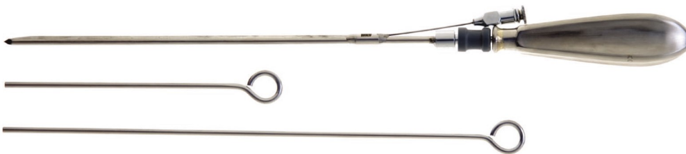
R29100 Rocket KCH™ Reusable Introducer Set

The Rocket® KCH™ Fetal Bladder Drain is a fetal vesico-amniotic shunt for lower urinary tract outflow obstruction intended for use in fetal urinary tract decompression following diagnosis of fetal obstructive uropathy in foetuses of 18-38 weeks gestation.